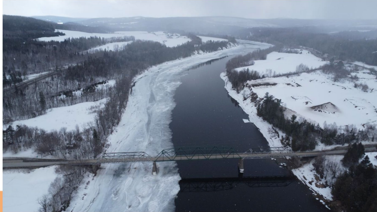
14:06, Km 47. Large open channel, looking downstream. Showing the Brooks bridge.