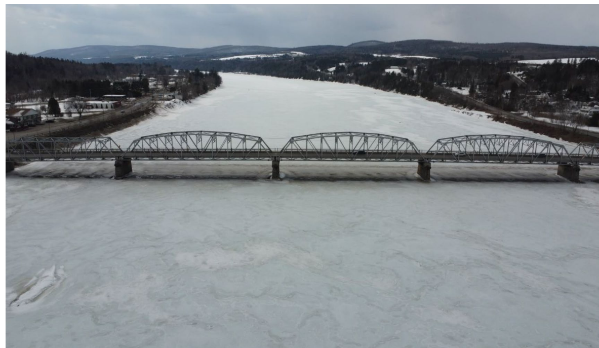
13:44, Km 24.5. Full ice cover, looking downstream. Showing the Perth-Andover bridge.